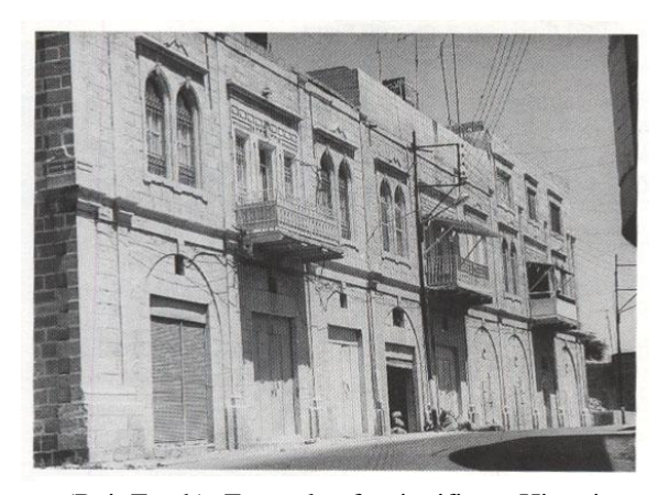
(Beit Farah)- Example of a significant Historic Elevation and Details

The following guidelines will address the Shop Fronts in Madaba and will present a users' manual for a more truthful and authentic intervention.