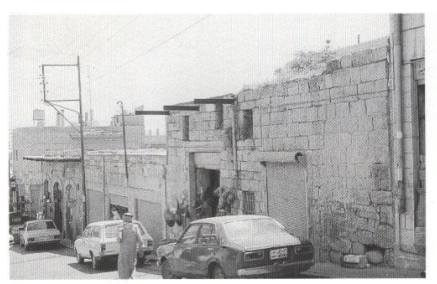
Shops on al-Hashimi Street