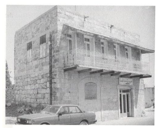
(Pharmacy Building)-An example of Housing on Top of stores in the Historic Core

Note: Images in 'section (1)' of this report are acquired from the Book ('Madaba: Cultural Heritage', edited by P. Bikai and T. Dailey, 1996 by ACOR, National Press/JORDAN).