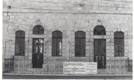
The northern section of Beit Jumean