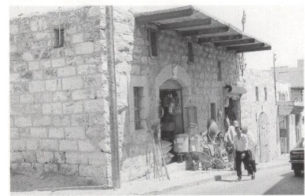
Shop on al-Hashimi Street